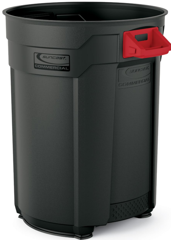
BMTCU55 model shown

Heavy-duty construction to withstand everyday use