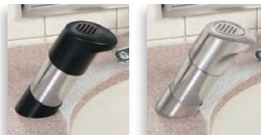
Black & Chrome 9930BLK