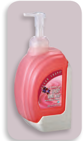
Shown with optional wall bracket 9907ZPL