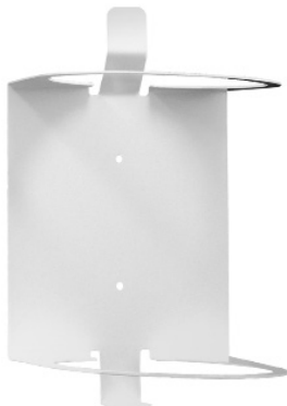
#9111 METAL TOWEL CANISTER HOLDER-LARGE - Metal, wall-mount, holds 120mm canisters - Ideal for (70-ct.) #1539, (100-ct.) #1566, (180-ct.) #1567, (180-ct.) #1568, #1574 CART WIPES, #1616