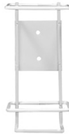
#9112 TOWEL CANISTER HOLDER - Wire, wall-mount, holds 81mm canisters - Ideal for #1448, #1500, #1541, #1565