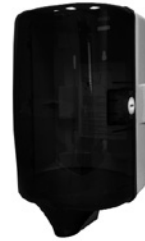
#9123 SMALL CENTER-PULL DISPENSER - Adjustable tension minimizes roping and maximizes perfwing with different towel types - Fits (250-ct.) #1566 and (525-ct.) #1448, #1574 QUICK WIPES - Durable, smoky black plastic - Lock prevents tampering