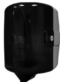
#9125 LARGE CENTER-PULL DISPENSER - Adjustable tension minimizes roping and maximizes perfwing with different towel types - Fits (400-ct.) #1539, (900-ct.) #1567, #1574 FACILITY WIPES - Durable, smoky black plastic - Lock prevents tampering