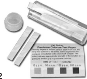
#9122 CHLORINE TEST STRIPS - For testing solutions of #778 SC SANITIZING RINSE