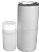
#9120 WATER TREATMENT SAMPLE KIT - For submitting samples of boiler and cooling water