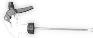
#9115 TRIGGER SPRAYER - PINTS - Fits pint bottles - Chemical resistant