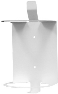
#9105 METAL TOWEL CANISTER HOLDER-MEDIUM - Metal, wall-mount, holds 100mm canisters - Ideal for (40-ct.) #1447, #1545, #1546, #1549, #1558