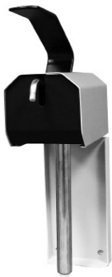
#9110 WATERLESS HAND CLEANER DISPENSER - Wall mount - Holds 1-gallon flat top containers